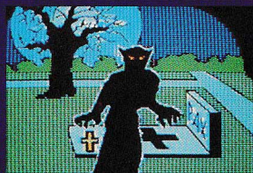
Scenes from Transylvania